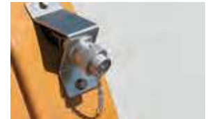
Front Electric/ Multi-Function (excl. SR160)