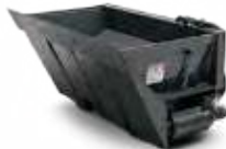
Side Discharge Bucket