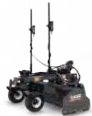
Laser Grading Box