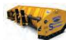
Arctic® Sectional Sno-Pusher™

SEE OUR FULL LINE AT CASECE.COM/ATTACHMENTS